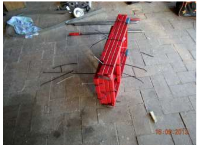
The seed delivery tube from the meter to the tine is shown on the left. If required, the tine can be removed, and a disc opener used as an alternate soil engaging tool. The picture on the right shows the frame 'flat packed' for transport to Africa.