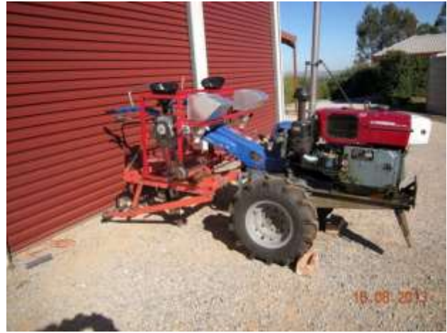
The basic frame (left) with the fertiliser meters. An overall view of the unit (right) showing the vertical spoon feed metering system and the fertiliser boxes. No down tubes or drive chains have yet been fitted. Note the 'temporary' seed boxes on the top of the seed drill.