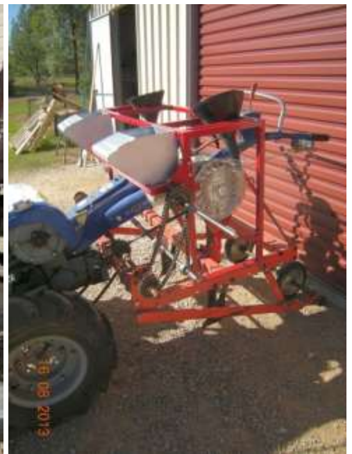
These views show more of the detail. The drive from the ground wheel goes to the original countershaft above the front tool bar. This further drives to a lay shaft immediately behind the front countershaft, and then to the vertical spoon feed meters. This set-up allows a variety of sprocket sizes to be used for maximum flexibility in choice of seed and fertiliser rates.