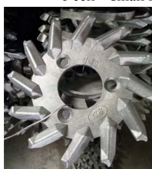
12 cell – small maize seeds