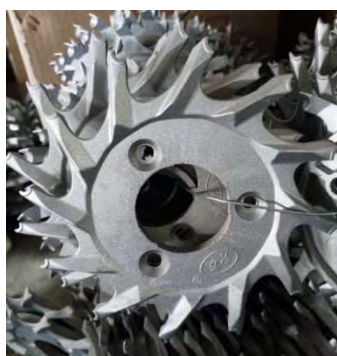
12 cell- all other small grains

Note that all seed plates are made from aluminium alloy. No plastic plates are currently available. Note also that no blank plates are available. (Some manufacturers have blank plates as an option and the farmer drills holes as required around the periphery to suit the type of grain being planted.)