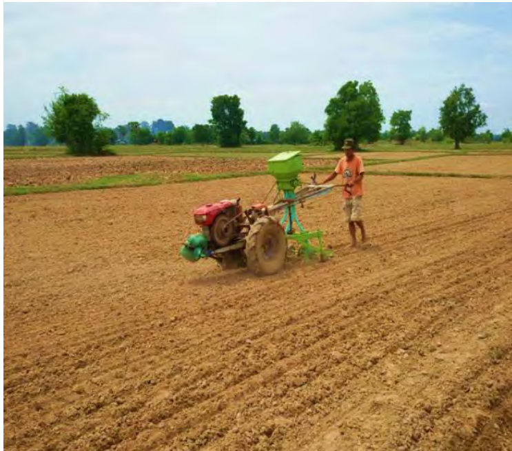
Direct seeding of rice in Laos, using a Thai made seed drill.