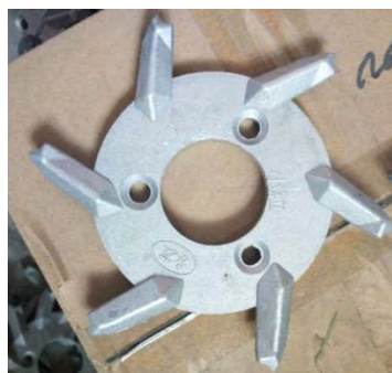
6 cell – small maize seeds