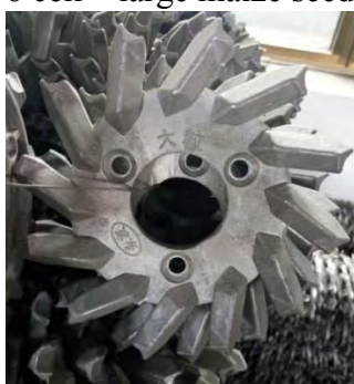
12 cell – large maize seeds