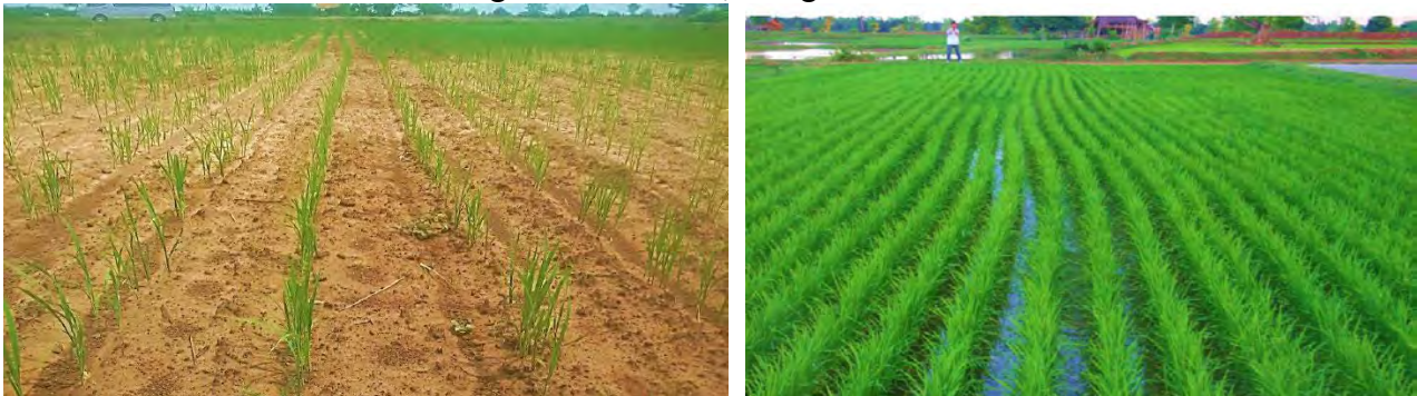
The same crop at 10 days (left) and 35 days (right)