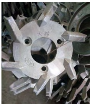
6 cell – large maize seeds

Various types of 2WT row crop planters are now using the Chinese made 12 cell vertical seed meters. However some are concerned at the lack of choice of seed plates to suit these meters. I contacted the Chinese supplier, who replied that at present there are seven different seed plates available. They are set out below.