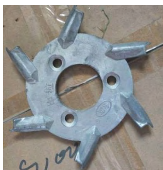
6 cell – med. maize seeds