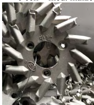
12 cell – med. maize seeds