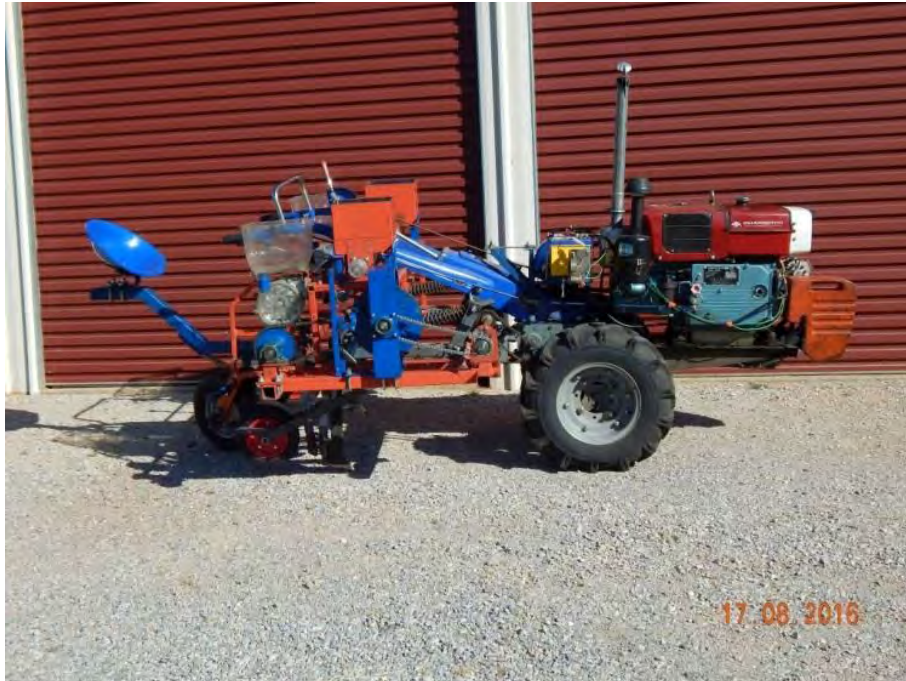
Overall view of the planter