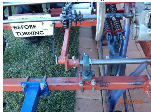
Seed and fertiliser drive clutch (left) The Pitman arm crank to turn the tool bar (right)