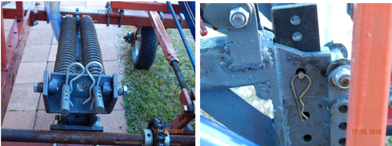
Spring loaded tines with adjustable tension clips (left) Adjustable depth tines (right)

The planter is practically complete, although quite a few small faults have yet to be rectified. It is a real challenge to incorporate all of the desirable features into the space available.